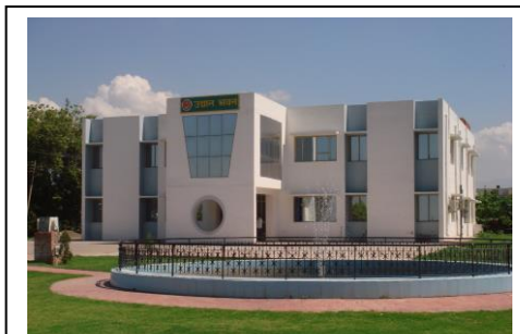
Directorate Horticulture, Panchkula

Prior to 2005-06, the horticulture programmes were implemented with the staff strength of around 99 personals. For the proper implementation of new schemes like NHM and MI, State Govt. has sanctioned 48 new technical posts viz. one Joint Director Horticulture, two Deputy Directors, five specialists at head quarter and Assistant Project Officers in each NHM district. The APO assists the DHO for proper implementation and follow of the schemes. Horticulture Department was bifurcated from Agriculture Department into new department in the Sept. 1990. The Directorate of the Department is located in Udhyan Bhawan, Sector-21, Panchkula and has 21 district offices and 25 Government Garden & Nurseries across the State. These offices provide all the extension services in the field of horticulture. Further, the quality planting material is available in these nurseries.